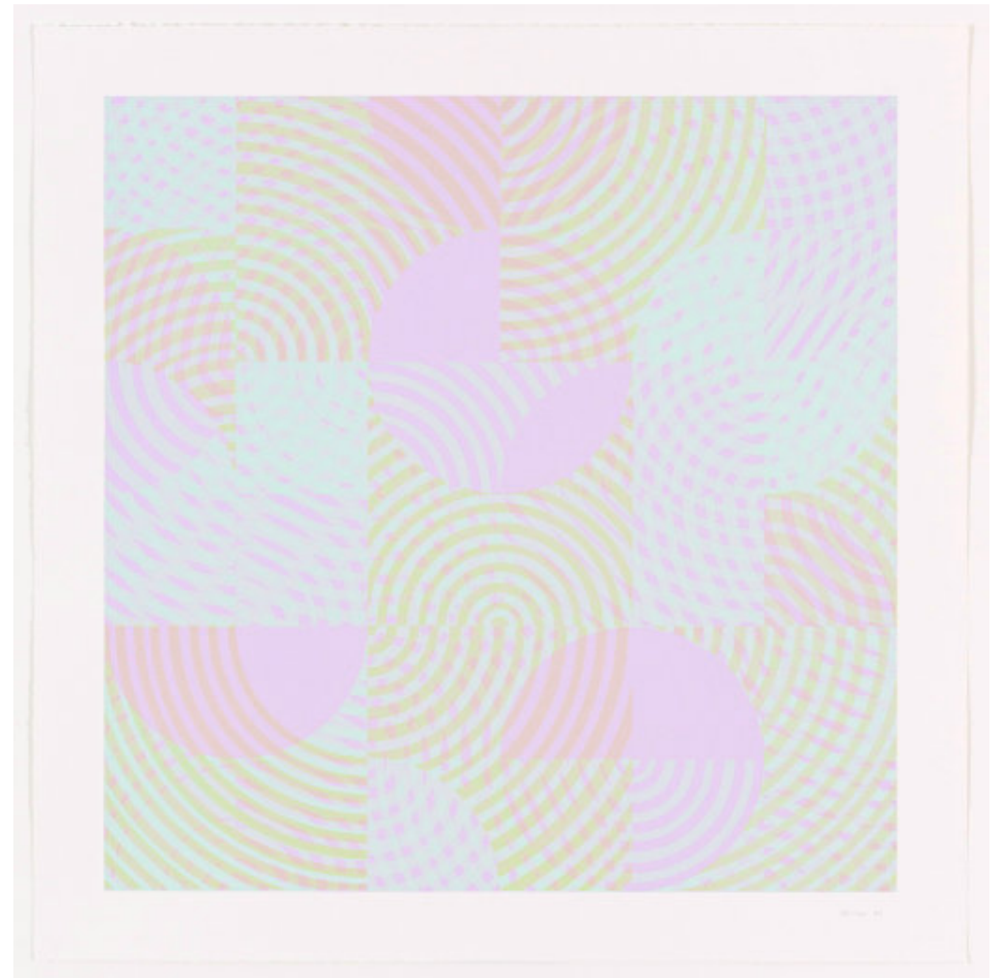
Alex Charrington Study in Cyan, Magenta, Yellow and White (VIII) & Untitled, 2011 Screenprint on Somerset Velvet 300gsm Paper Edition Size: Monoprint, 71 x 71cm £1400 Framed Pair